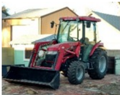
Our new tractor. Now we just need to raise funds to transport it to Moz.

to provide hands-on training to Mozambicans so that they can develop their own businesses and create new jobs. In addition, the shoe business that Leonard has been developing has located a site for a shoe factory. This is a Mozambican factory, not a mass-production Western factory, just to be clear. The workers there make shoes by hand and by using sewing machines. In